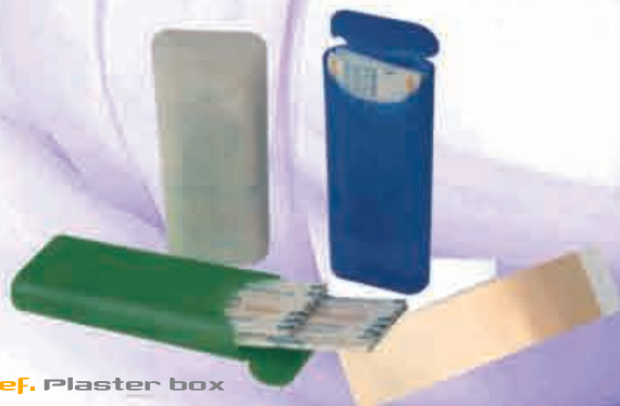
Ref. Plaster box Boîte de pansement adhésif