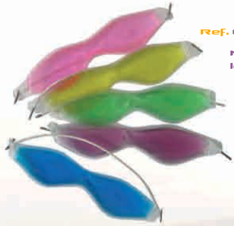
Ref. Eye Mask