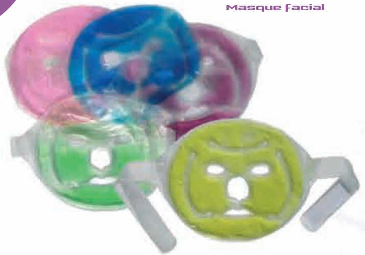
Ref. Facial Mask Masque facial