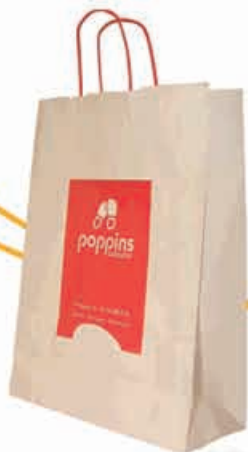
Ref. 5001 Paper bag Sac en papier