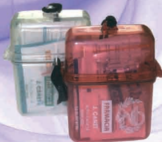
Ref. First-aid kit Boîte de secours pour la plage