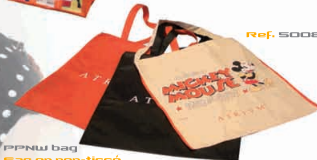
Ref. 5008 PPNW bag Sac en non-tissé