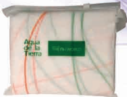
Ref. Raincover Ciré