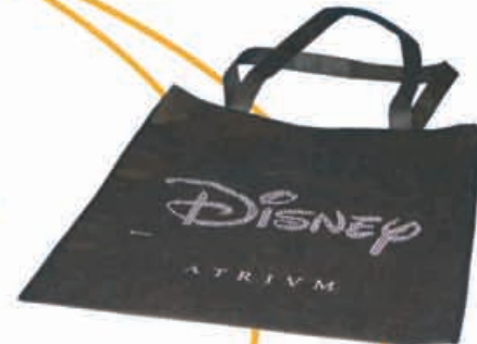
Ref. 5009 PPNW bag Sac en non-tissé