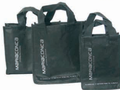
Ref. 5005 PPNW bag Sac en non-tissé